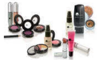
Mineral based cosmetics -Available at AMA-CWE